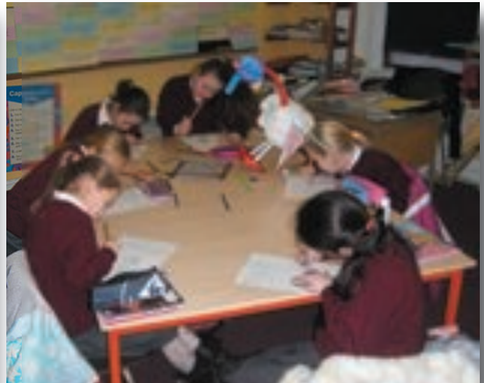
Working Together. Working Well.

For information on enrolling your child contact the school at any time: