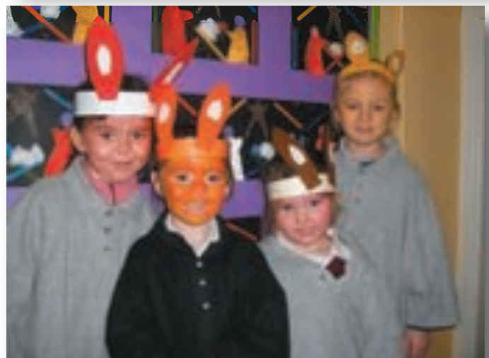
Infant Nativity Play.