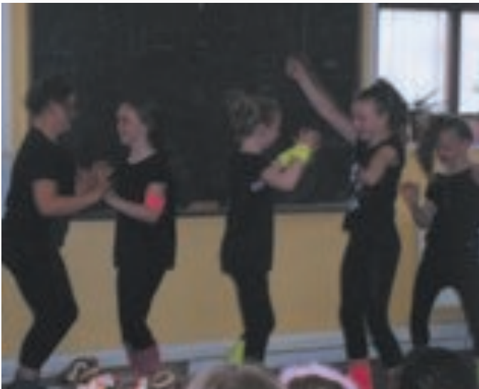
Rehearsing for School Musical in Andrews Lane Theatre.